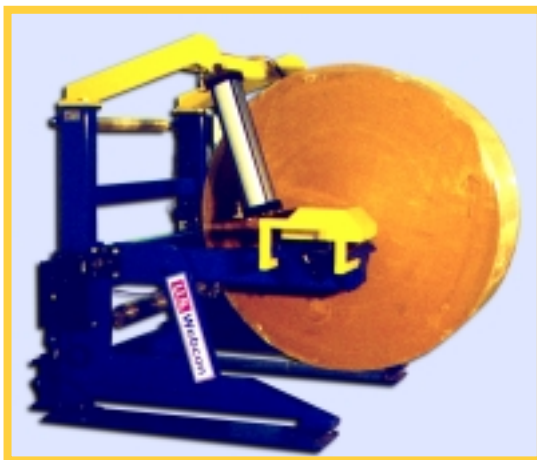
The pictures show a shaftless unwind with fixed width pedestals, transducer roll control cluster, pneumatic brake and pneumatic cylinder roll lift mechanism.

The Skyhook series can be further customized to meet your production needs